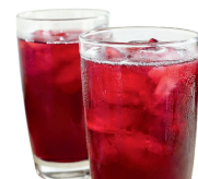
AGUA DE JAMAICA