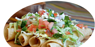
FLAUTAS DE POLLO