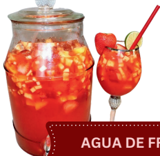
AGUA DE FRUTAS