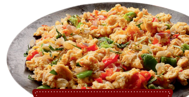
HUEVOS A LA MEXICANA